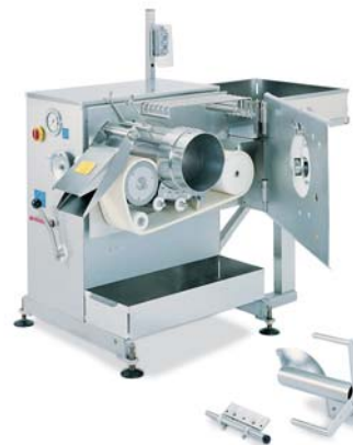
Perforated drum in use