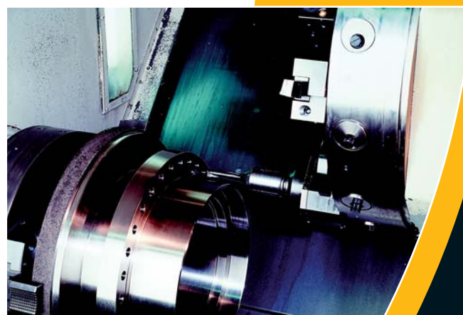
Finishing on one of our CNC machines

resistant coating with coating thicknesses of > 5 mm can be applied centrifugally in order to extend the service life by several times. Here too, we offer special grades in hardnesses of 50 to 65 HRC with good corrosion resistance.